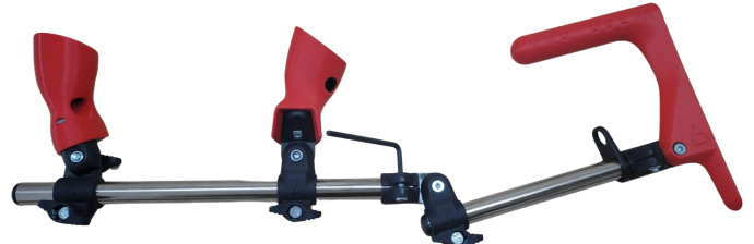
Tighten the screw on the connector (not too strong, you do not want to break it).