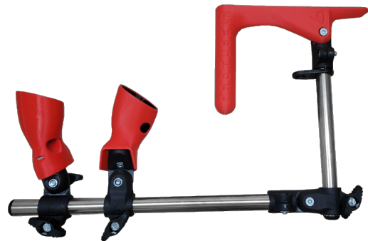
Loosen the stock's screw and position it in a square (90°) angle with the tube.