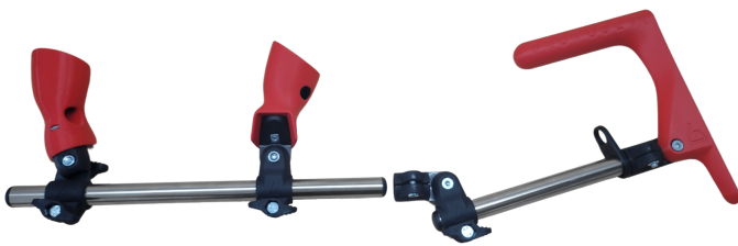
Insert the Starter's tube in the stock upgrade's connector.

Make sure you work in a clear area and be very careful, some parts can be easily lost.